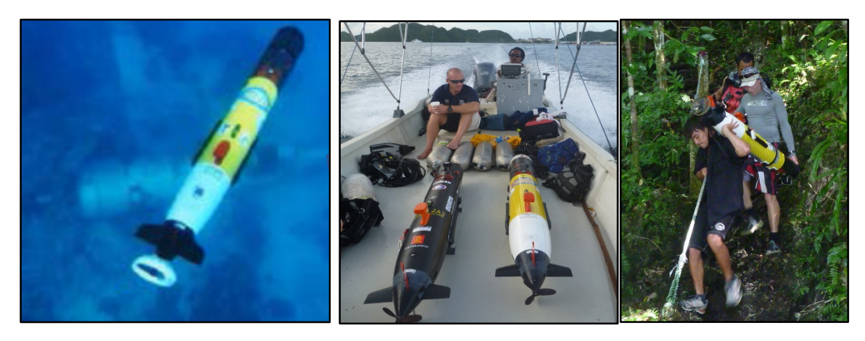
Figure 1 . Left Panel: REMUS 100 passing over a sunken WWII aircraft; Center Panel: En route to a small boat deployment for two REMUS 100s and Right Panel: En route to a shore deployment of a REMUS 100.

Unlike ship-mounted sensors, propeller driven underwater vehicles have a distinct advantage to navigate a grid or terrains with consistent and thorough geo-positioned tracks. Scripps currently has been operating for over a dozen years and performs a variety of ocean sensing missions including mapping wastewater, river discharges, and mapping hazards, benthic habitats, and areas of archeological significance including sunken ships and missing aircraft that support the national mission of finding and returning MIA from past wars.