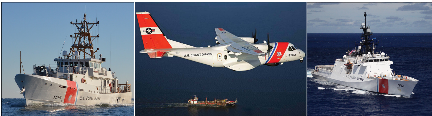
Figure 1: The Coast Guard's National Security Cutter, HC-144A Maritime Patrol Aircraft, and Fast Response Cutter

In the 1990s, the Coast Guard began an initial effort to modernize its aging assets that would allow it to successfully meet mission demands. After the September 11, 2001 terrorist attacks, the Coast Guard became a component of the newly established Department of Homeland Security (DHS), which resulted in an increase in mission demands. 3 In order to meet this increase, the Coast Guard completed a Mission Needs Statement—the document that describes the mission(s) and needed capabilities to justify a given program—in 2005. The 2005 Mission Needs Statement compared the new assets for which the Coast Guard originally planned to procure—in 1996 prior to the creation of DHS—to replace its legacy assets to the demands of the new missions as laid out by the recently formed DHS. Based on the 2005 Mission Needs Statement, DHS approved a program of record in 2007—known as the Deepwater program—that provided the additional capability required. This effort was expected to last 25 years at a cost of $24.2 billion resulting in either the rebuilding or replacing of vessels and aircraft that were reaching the end of their expected service lives and were in deteriorating condition. Figure 1 shows some of the Coast Guard's newer assets that are part of this broader modernization effort.