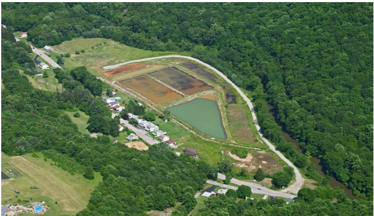
Aerial view of Kalp AMD Treatment System – Largest Source of Contamination in the Watershed