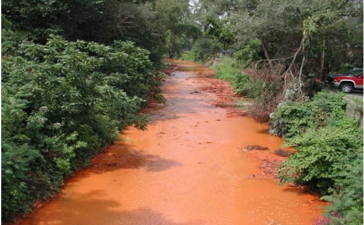
Millers Run Downstream of the Gladden Discharge