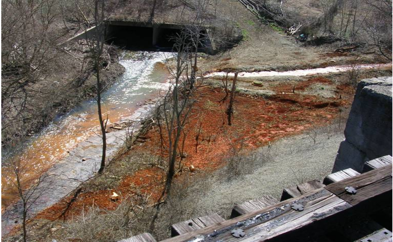
Gladden Discharge Confluence with Millers Run