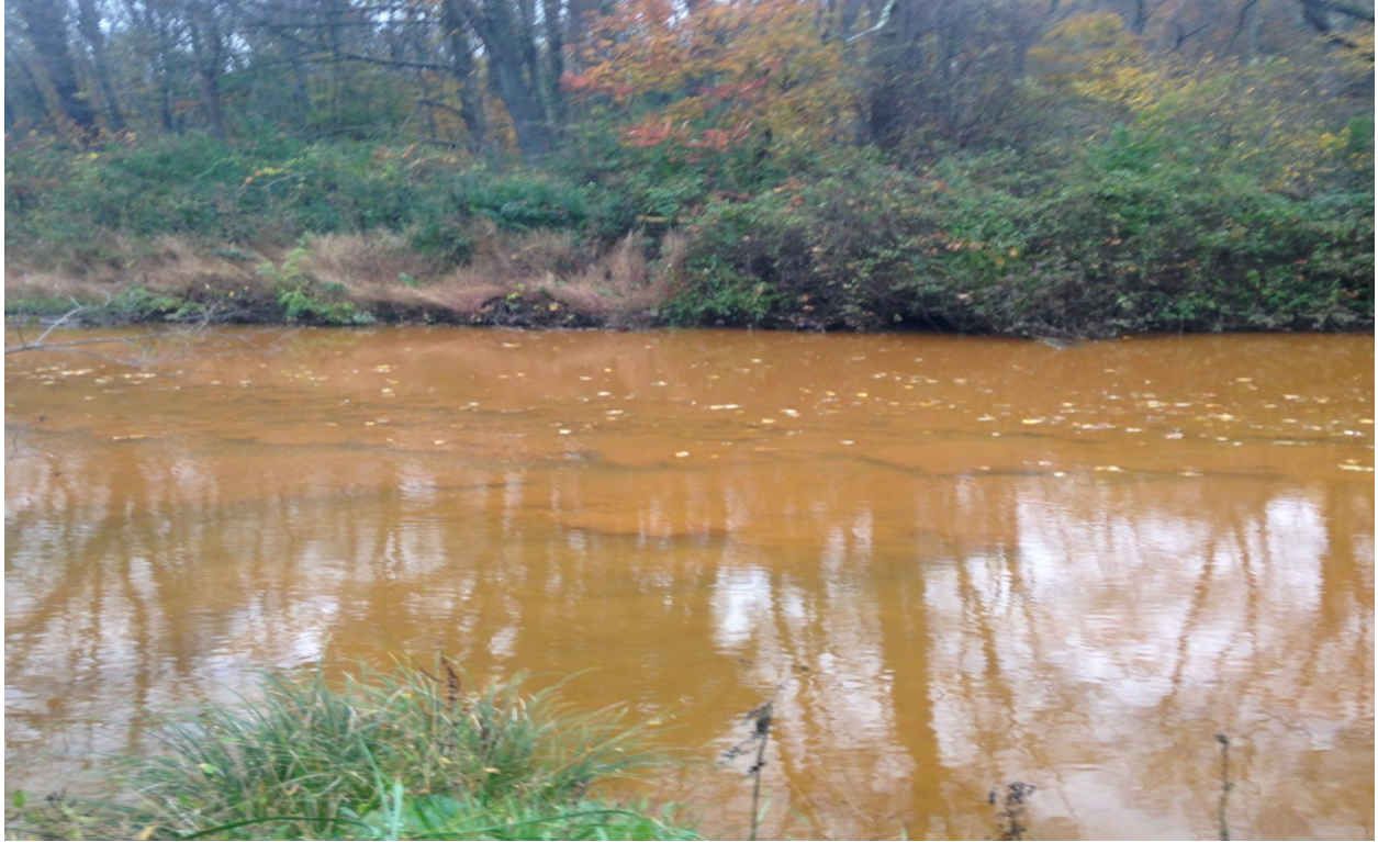
Indian Creek Severely Impaired by AMD Prior to Restoration