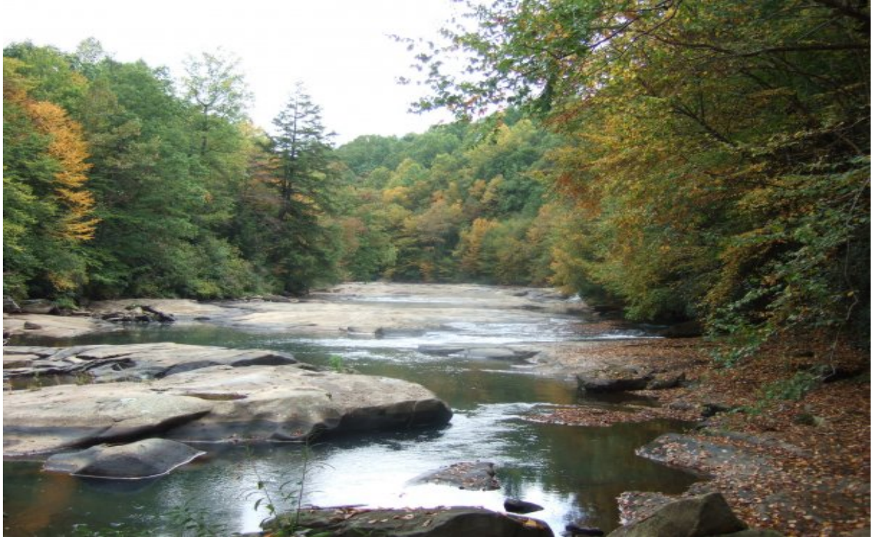
Indian Creek After Restoration