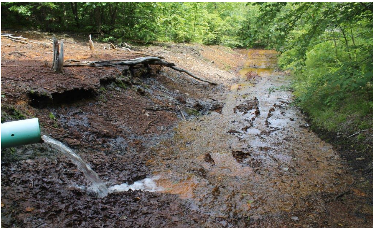
The Rondell-Coreal Abandoned Mine Discharge in the Indian Creek Watershed

MWA worked with the NRCS to develop a PL566 Watershed Restoration Plan (completed in October 2000) to address the most severe discharges and restore water quality in the Indian Creek Watershed. Since that time, MWA, NRCS and PA-DEP-BAMR have constructed six passive mine drainage treatment systems to treat the worst discharges in the watershed. Early in the project, it was clear that most of the treatment systems necessary to restore water quality in the watershed would need to be constructed on private property. The private landowners and the MWA were both extremely concerned about liability under the CWA. The MWA along with each of the private landowners applied for and received approval for PA Good Samaritan protections for their involvement in the project. Without this protection, this project never would have been undertaken or completed. As a result of remediation work undertaken, the stream has made a dramatic recovery and now supports a healthy fish and macroinvertebrate community. Once an eyesore and a liability to the local area, Indian Creek is now a community asset and a source of community pride. A walking trail was incorporated into one of the passive treatment system designs which ties to the Indian Creek Trail that is part of the Youghiogheny Trail Network.