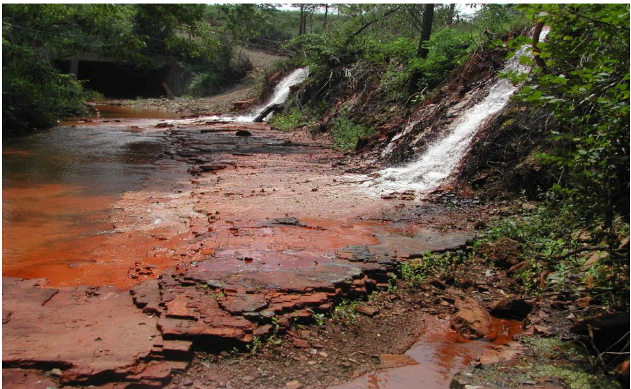
Gladden Discharge Flowing into Millers Run