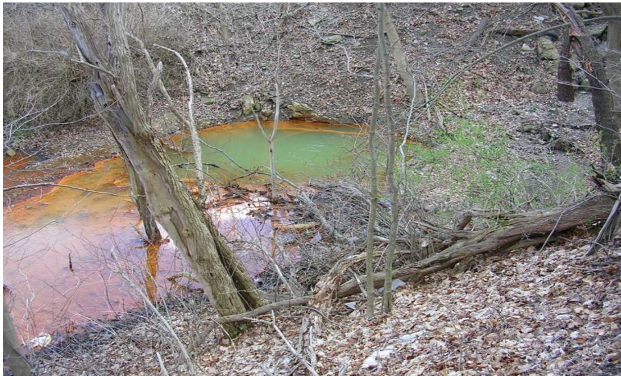
Gladden AMD Discharge in the Chartiers Creek Watershed