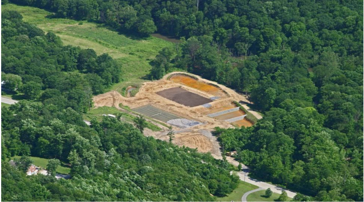
Aerial view of the Gallentine Discharge Passive Treatment System under Construction