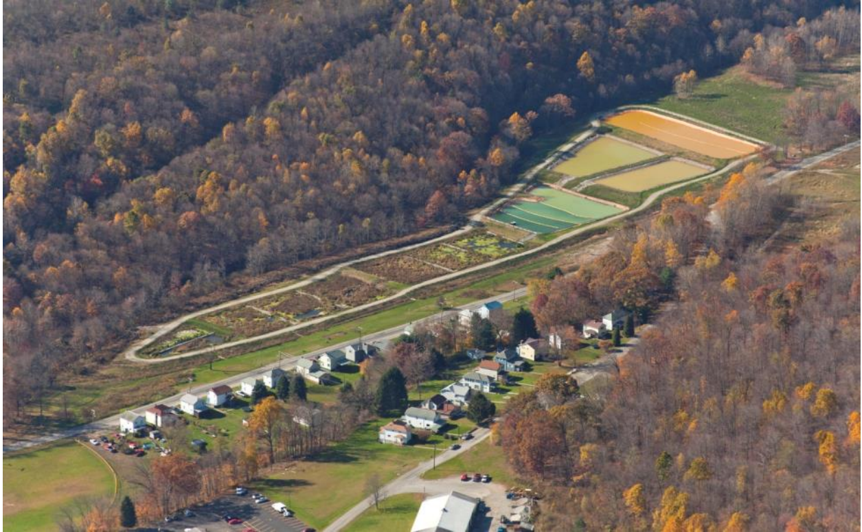
Aerial View of the Melcroft Passive Mine Drainage Treatment System