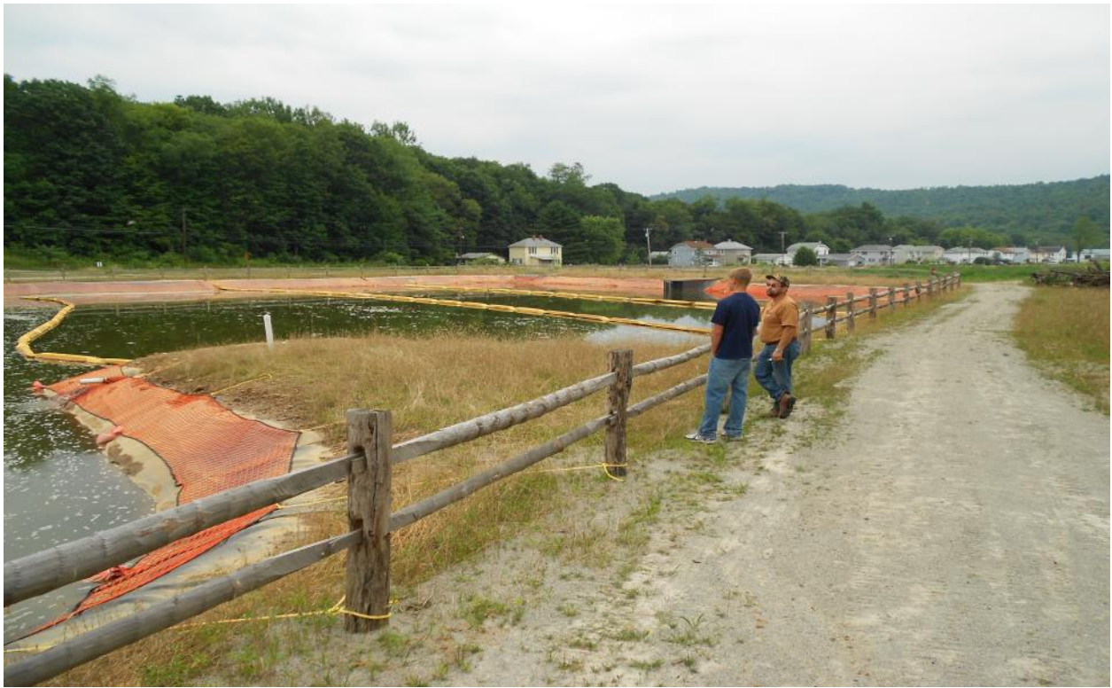
Walking Trail Incorporated into Melcroft Passive Mine Drainage Treatment System Project