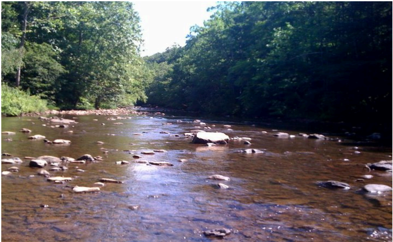
Indian Creek just Upstream of the Mouth near its Confluence with the Youghiogheny River