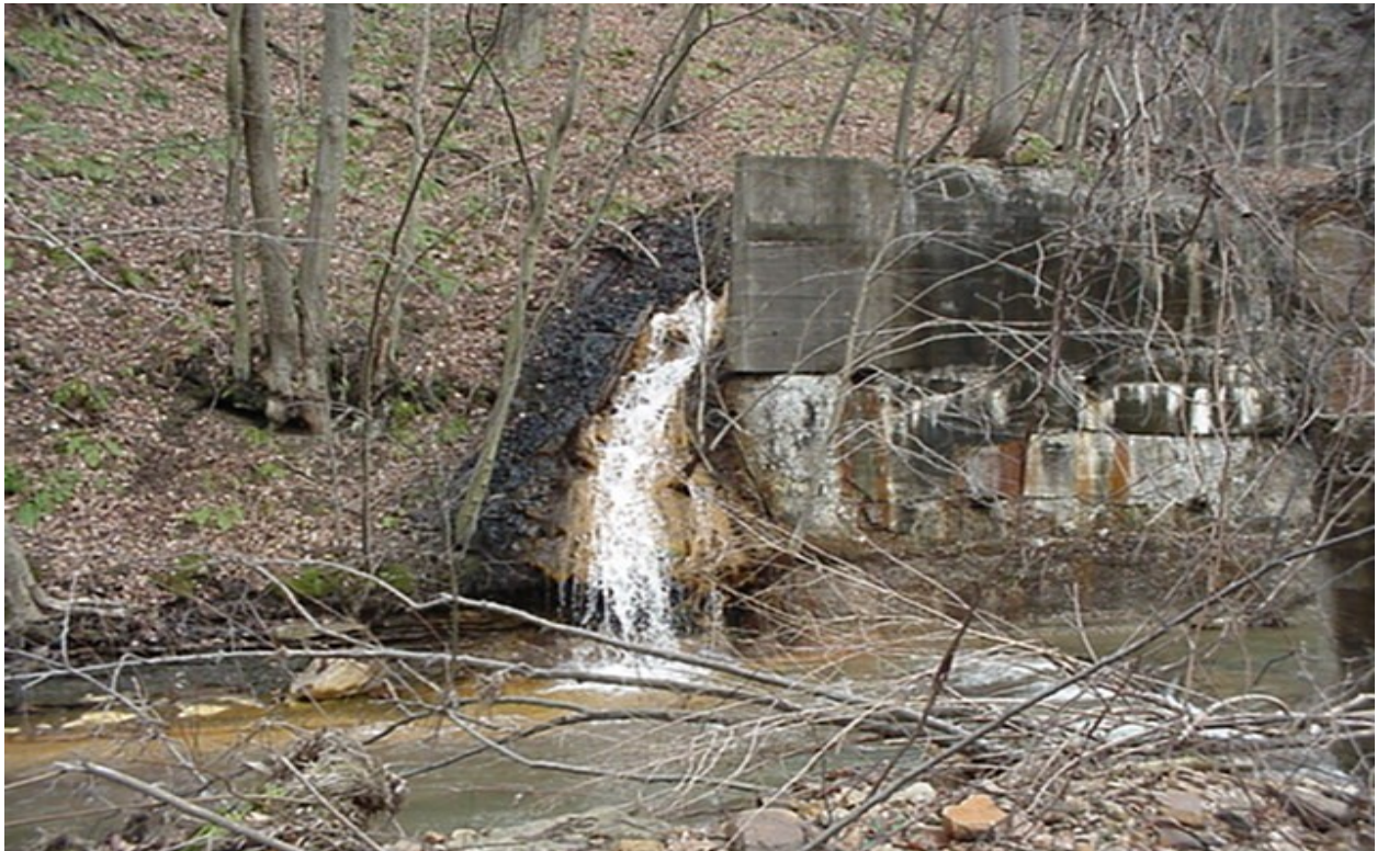
Abandoned Mine Discharge Near Melcroft Prior to Treatment