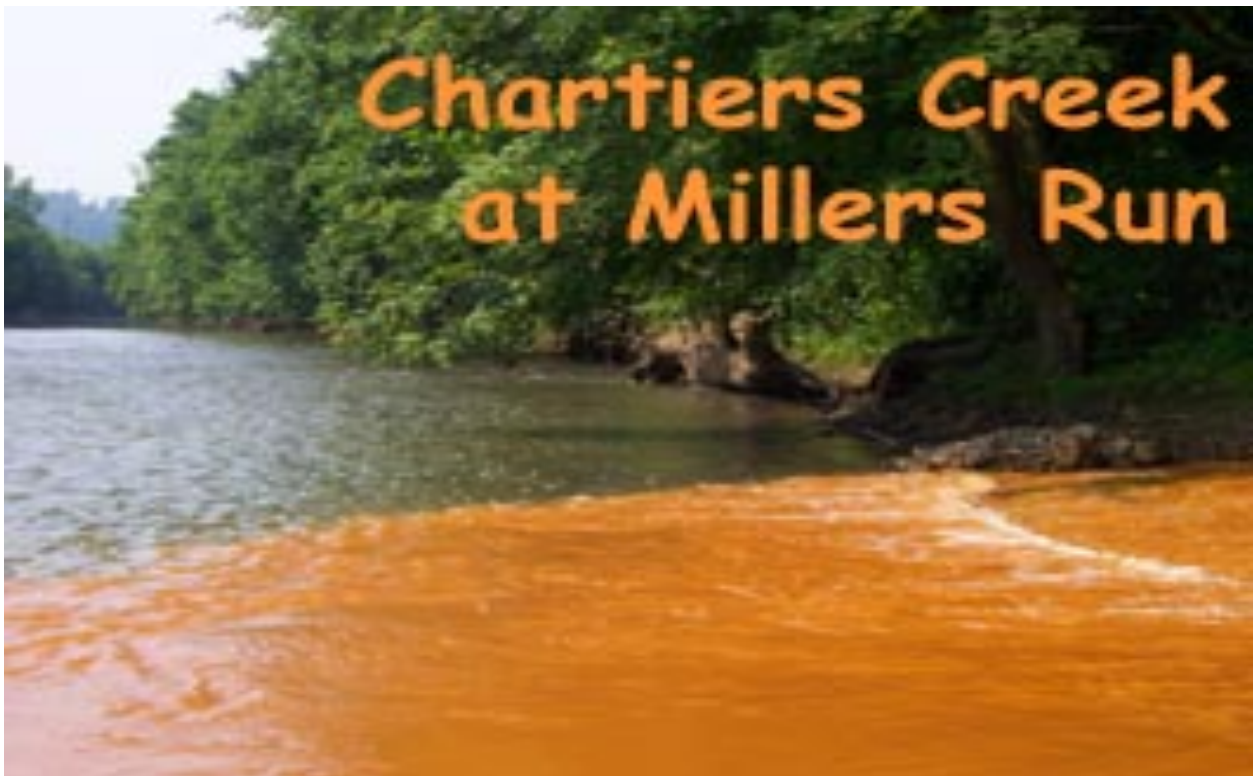
Confluence of Millers Run and Chartiers Creek