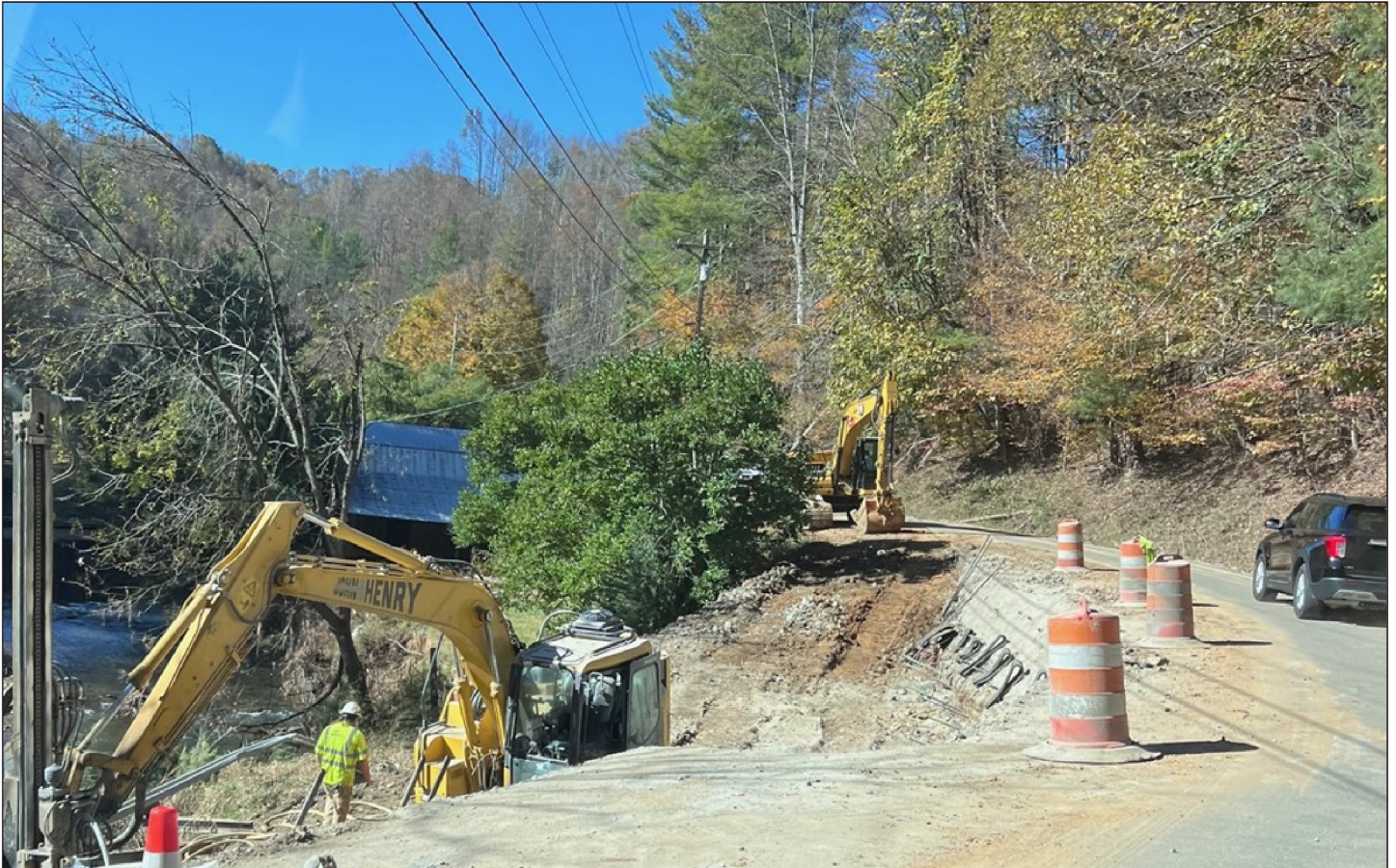
Figure 1: Road Repair Following Hurricane Helene, North Carolina