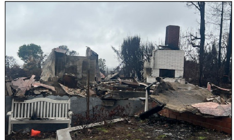
Fire damage following the Palisades Fire, Los Angeles, California