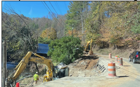
Road repair following Hurricane Helene, North Carolina