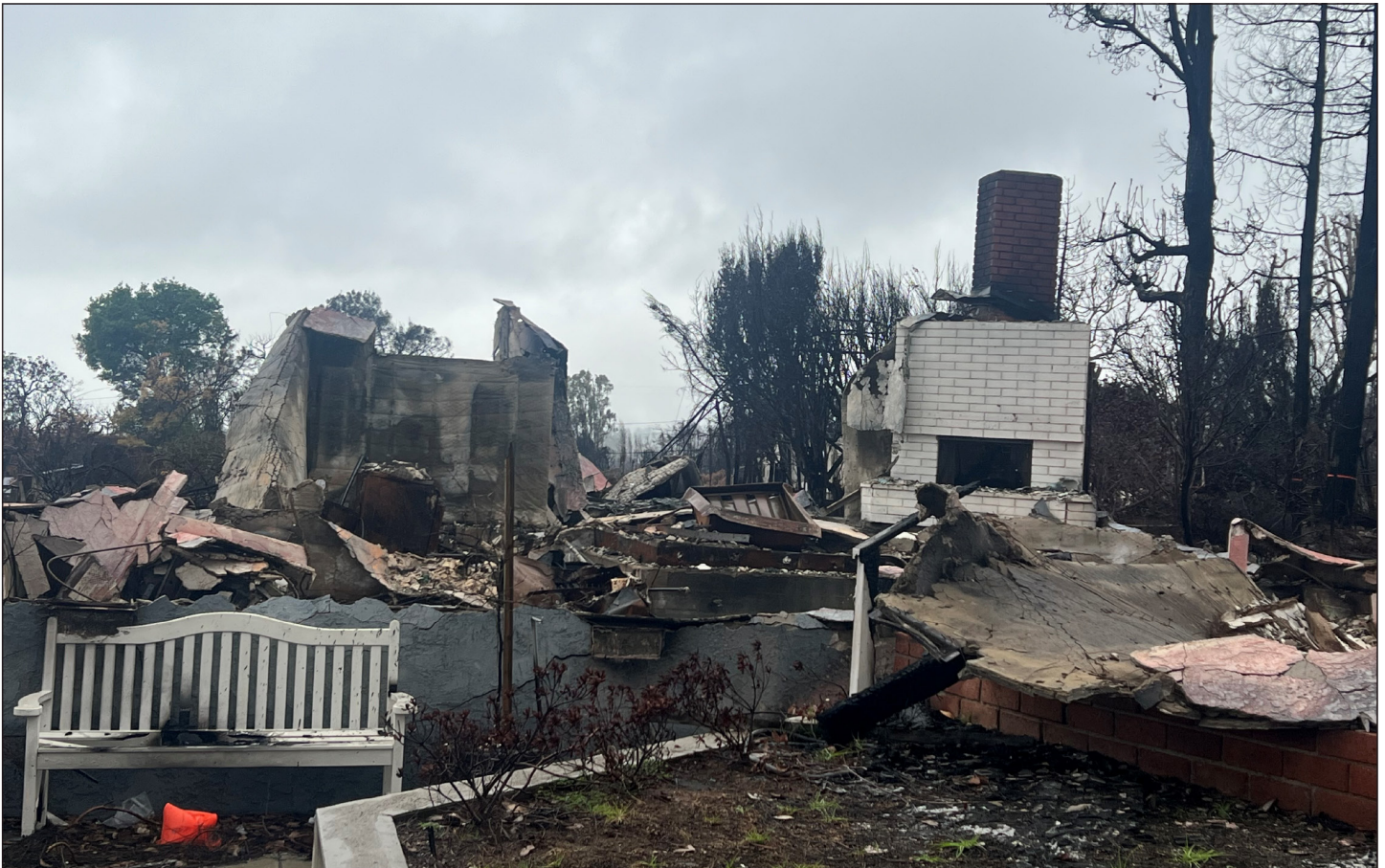
Figure 4: Fire Damage Following the Palisades Fire Los Angeles, California