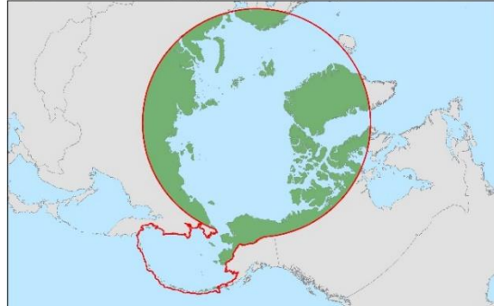
Figure 1. The Arctic as defined in U.S. statute.