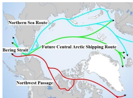
Figure 2. Arctic shipping routes.