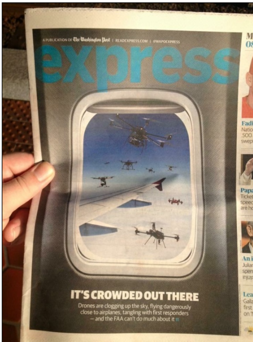
FAA's characterization of its data has led to sensationalized and inaccurate reporting, including in The Washington Post.

This happened first and foremost because the agency's own press release from August 12, 2015, bears the headline, "Pilot Reports of Close Calls With Drones Soar in 2015" and the FAA cited more than 650 reports. 1 When the actual reporting data was released on August 21, the FAA's characterization changed dramatically to describe these same reports as merely "possible encounters." During that intervening two-week period, public opinion was influenced by media coverage that relied upon, and cited, the FAA's description of these 650 possible encounters as "close calls." These media reports have, in turn, been cited by lawmakers in Washington and in various states as a reason to call for new legal restrictions.