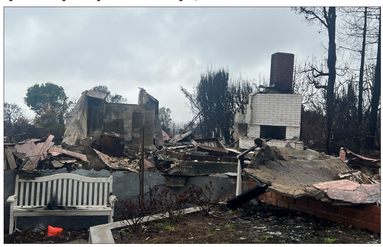
Figure 4: Fire Damage Following the Palisades Fire Los Angeles, California