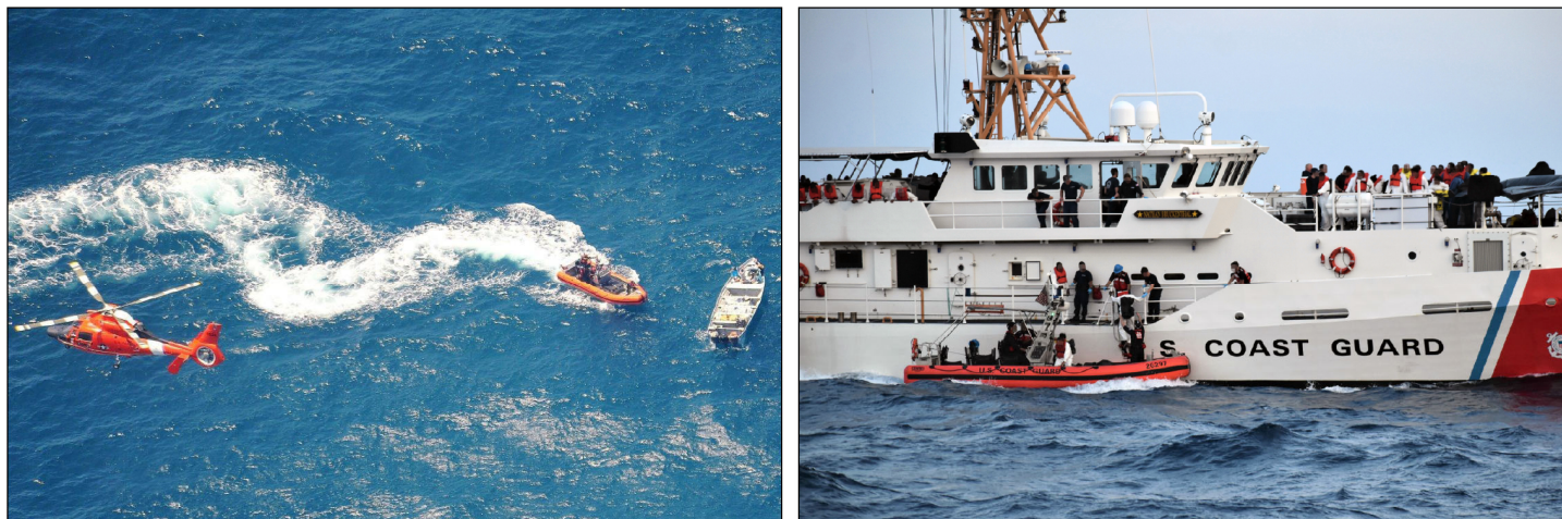
Figure 1: Coast Guard Vessels and Aircraft Interdict Smuggling Vessels; Interdicted Migrants on Coast Guard Cutter

GAO-26-108847