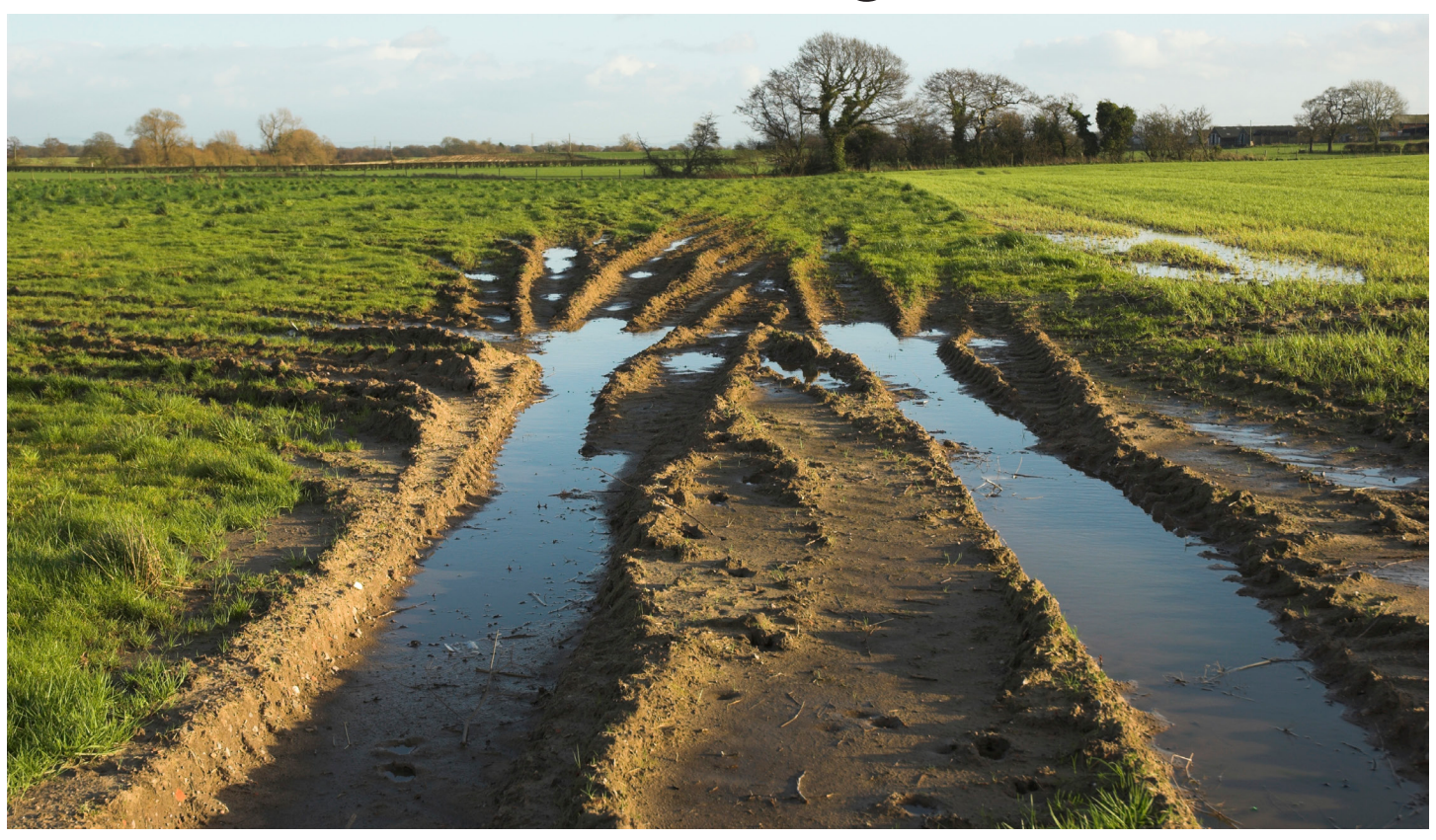
Despite the partnership established under the Clean Water Act and the limits to federal authority, the Administration in recent years has sought to expand the scope of federal jurisdiction under the CWA.

Most recently, in April 2014, the EPA and Corps put forward a proposed rule entitled "Definition of 'Waters of the United States' Under the Clean Water Act", which the agencies claimed would "clarify" federal jurisdiction. However, there are serious deficiencies with this rulemaking. Moreover, the sequence and timing of the actions that the federal agencies have taken to develop this rule undermine the credibility of the rule and the process to develop it, as well as the longstanding federal-state partnership to regulate waters. The Administration developed the proposal without first properly consulting state and local authorities; without considering their rights, their responsibilities, their liabilities, and their budgets; and without realistically examining the potential economic and legal impacts on private citizens, farmers, and other stakeholders.